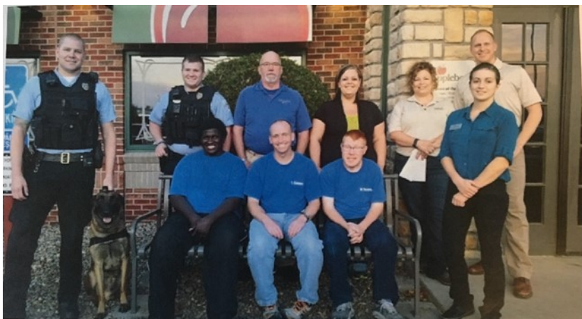
Bismarck Tip-a-Cop Volunteers

The Law Enforcement Torch Run (LETR) for Special Olympics and Applebee's Grill and Bars across North Dakota team up for the 9 th annual Applebee's Tip-a-Cop on September 20-21. Law Enforcement agencies in Bismarck, Devils Lake, Dickinson, Fargo, Grand Forks, Jamestown, Minot, and Williston volunteered to help serve tables and receive "tips" to raise funds for Special Olympics. This year, Applebee's restaurants statewide raised close to $19,000 to support athletic programs for children and adults with intellectual disabilities! Thank you Applebee's and Law Enforcement for your continued support!