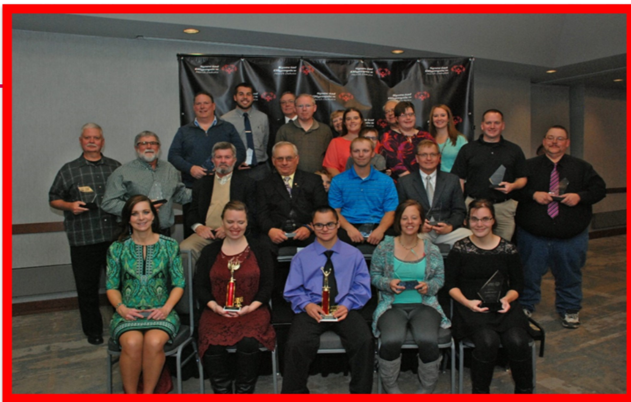
2016 State Award Winners